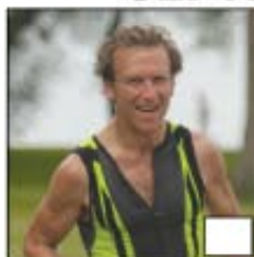
Seymour Rifkind Ultramarathon